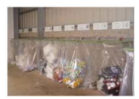
Packaging collection in a container park

This central commercialisation concerns clear, green and coloured PET bottles, PEHD flasks, PE films, PP/PS yards and pots, expanded PS, metal packaging, beverage cartons. These materials represent a total of 1.200 tons a year. Glass and paper/cardboard are not concerned.